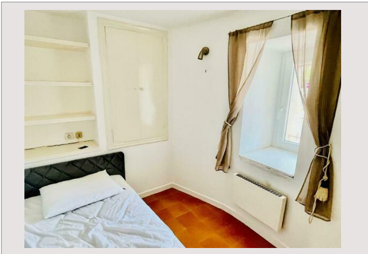
logement très performant